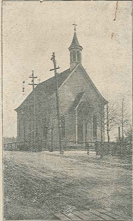
ST. JOSEPH'S, ANDERSON, S. C.