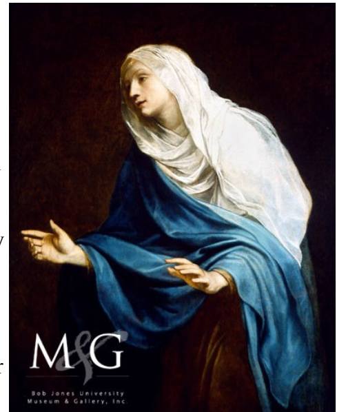
Mother of Sorrows

on the university's campus at 1700 Wade Hampton Boulevard in Greenville. It is open on Tuesday through Sunday from 2:00 p.m.-5:00 p.m. except for holidays and special events. Admission is $5 for adults, $4 for seniors (age 60 and over), and $3 for students with a school ID card. Children 12 and under are admitted free. Audio guides can be rented for an additional $5 fee while scavenger hunts for children are available at no charge. Guided tours are available by reservation for groups of 10 or more. For more information, visit http://www.bjulg.org/ .