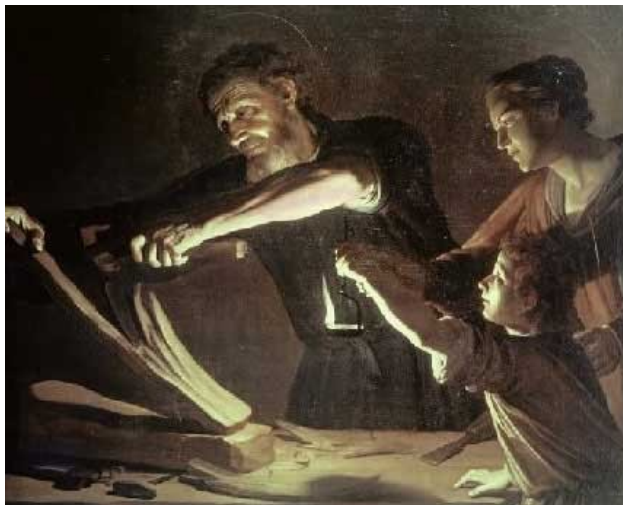
The Holy Family in the Carpenter Shop

Today, the museum displays Italian, Spanish, French, English, Flemish, Dutch, and German sacred art from the 14th through the 19th centuries in over 25 galleries. In addition to paintings by major artists such as Rubens, van Dyck, and Ribera, the exhibitions feature