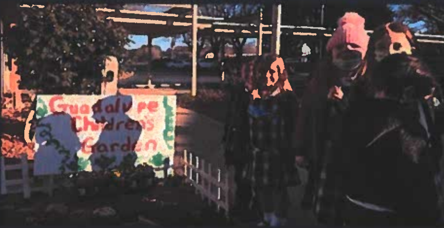
Blessing of the Guadalupe Children's Garden

To see more photos visit facebook.com/StJosephCatholicSchoolAnderson