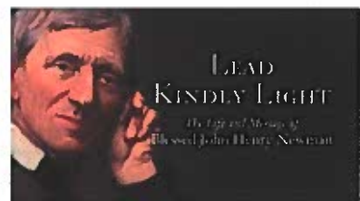
POWERED BY AUGUSTINE INSTITUTE