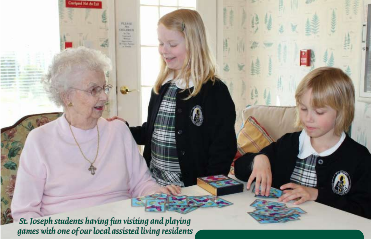
St. Joseph students having fun visiting and playing games with one of our local assisted living residents