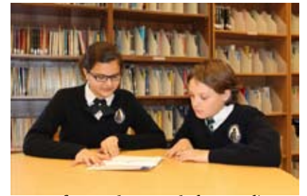
Two of our Duke TIP Scholars reading a Junior Beta Club brochure

Attending St. Joseph is an experience of a lifetime. Service opened my eyes to how much people need my help.